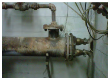
Why settle for this?...